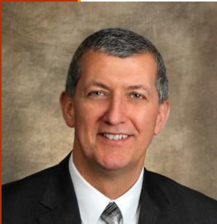
Paul Davis, Premier of NL

Paul Davis was elected the 12th premier of Newfoundland and Labrador on September 26th, 2014. He was born in the town of Conception Bay South and joined the Royal Newfoundland Constabulary (RNC) after graduating from college. Mr. Davis stayed with the RNC for 25 years until he retired in 2010. He worked on the Conception Bay South Town Council and was elected as a member of the House of Assembly in 2010.