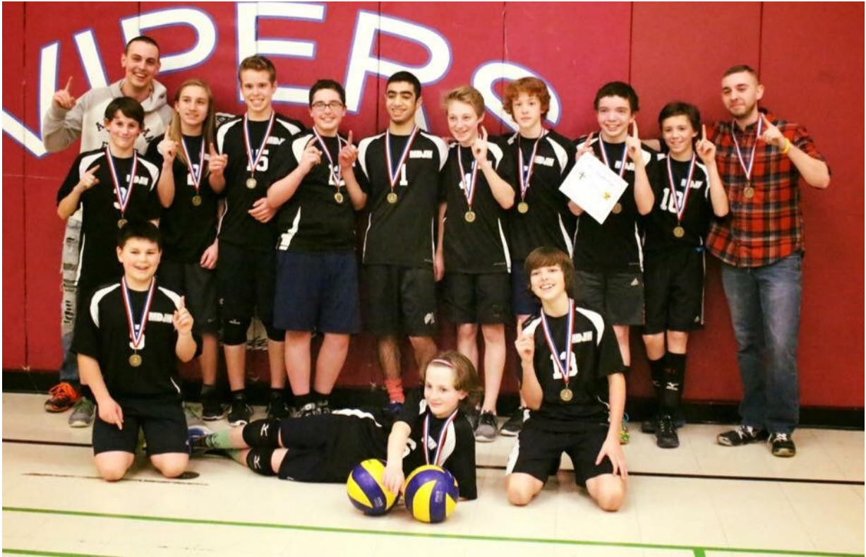
MDJH Grade 8 Boys' Volleyball team were tournament winners at the St Paul's Invitational in February. Congratulations to the players and coaches. Well done!