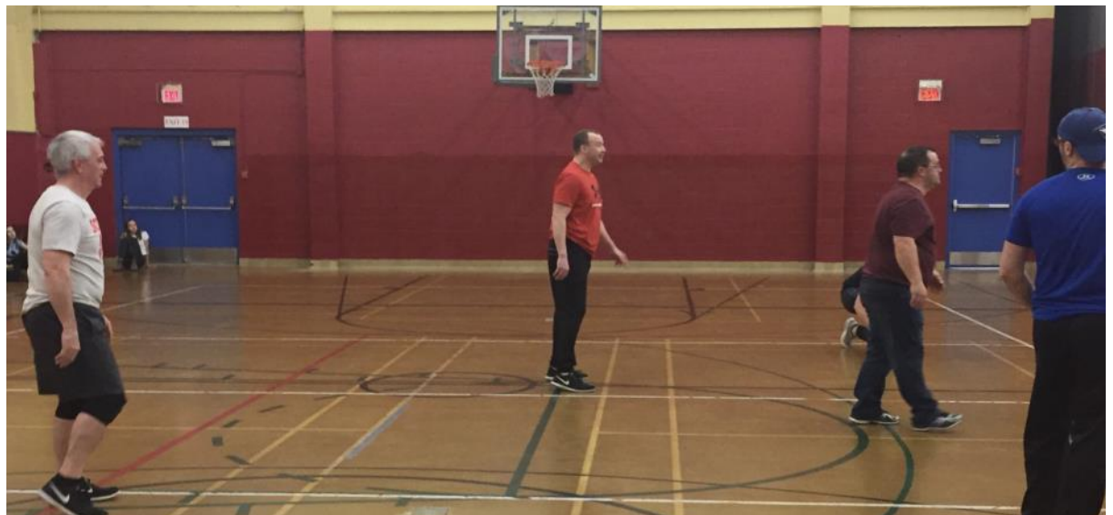
MDJH teachers win one/lose one as they take on the Grade 9 Girls Volleyball Team for Spirit Week!