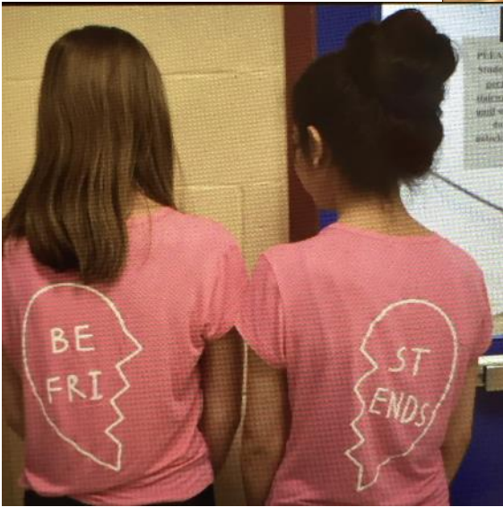
All kinds of pink shirts for #PinkShirtDay